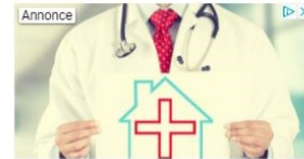
Vivortho - centre orthodontie courbevoie

ADM-Vietnam continue, en effet, d'aider, depuis 27 ans, les professionnels de santé au Vietnam afin d'améliorer les qualités des soins médicaux. Elle apporte une aide médicale directe (instruments, consommables, médicaments...).