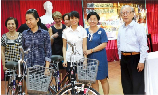
Dans de vélos à des jeunes en difficulté de Huế (Centre).

Solidarité. Dans l'objectif d'aider les professionnels de la santé et d'améliorer la qualité des soins médicaux, l'Association pour le développement médical au Vietnam (ADM Vietnam) vient de finir en beauté sa mission 2018.