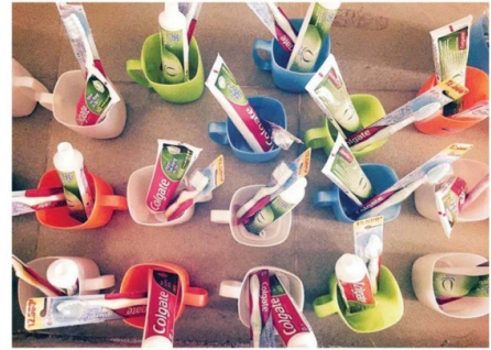
Dons de kits de brosse à dents d'ADM Vietnam.

Enfin, une campagne de dépistage du cancer du sein a été prise en charge par ADM à l'Université de médecine de Huế. Pour le volet social, de nombreuses activités ont été menées, par exemple des cours d'ostéopathie pour de jeunes masseurs aveugles, le don de 20 fauteuils roulants pour des enfants paralysés, ou encore 45 bourses et 20 vélos remis à des élèves pauvres et méritants dans le secteur de Huế. Quant au volet francophone, ADM Vietnam a organisé des tables rondes en français avec élèves, étudiants et professeurs, notamment dans les facs de